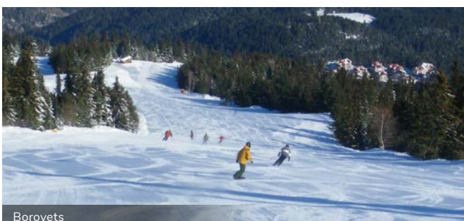
Figure 1 Adult Ski Resort Report 2022-23